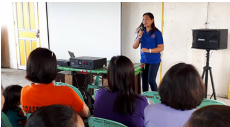
A dental officer giving a lecture on good nutrition and dental hygiene for CCAD members