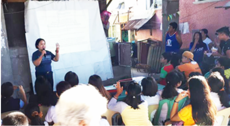
A PCGA officer giving an orientation on mangrove rehabilitation and proper outplanting procedures