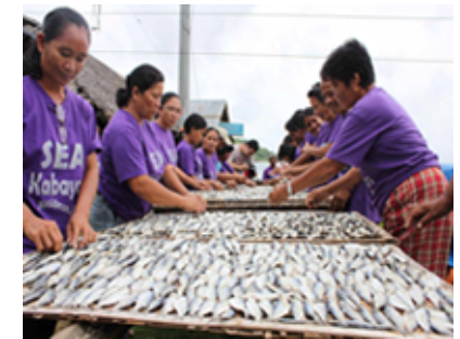
Dried fish packaging