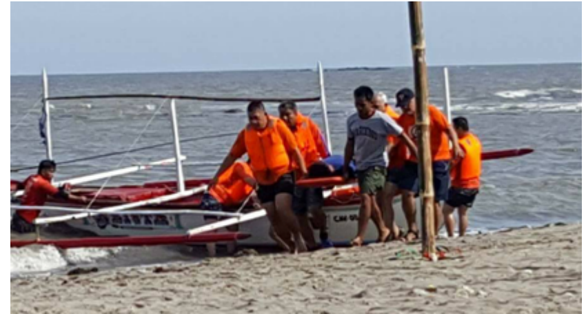
Search and Rescue