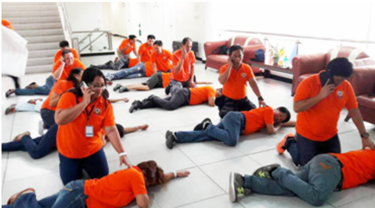
Basic Life Support